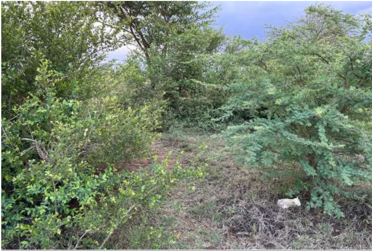
Figure 6: Another portion of the site proposed for the development.