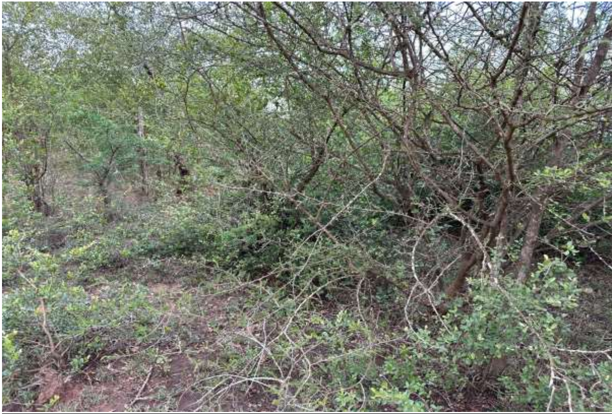
Figure 8: View of the vegetation thickets in the proposed site of development.

Figure 7: Another portion of the site where some vegetation has been eaten by animals on the farm.