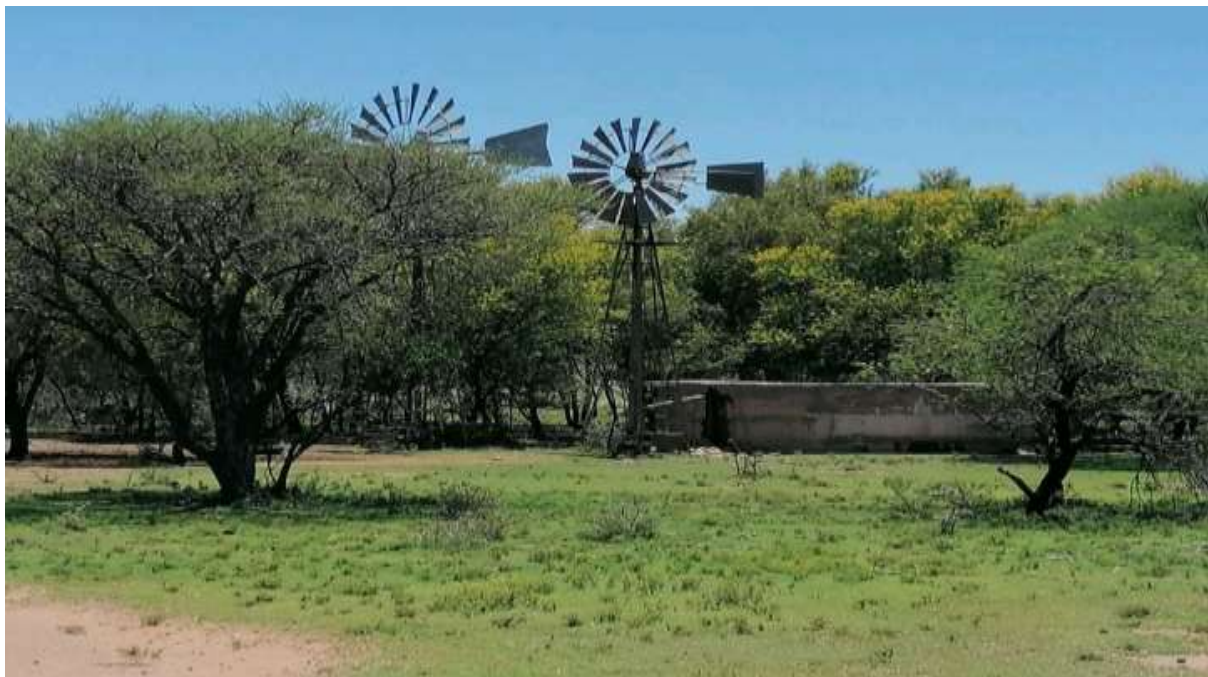
Figure 3: View of the wind mill and some related farm infrastructure on the proposed site of development.