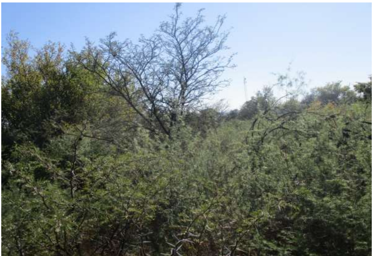
Figure 5: Another view of the site proposed for the development.