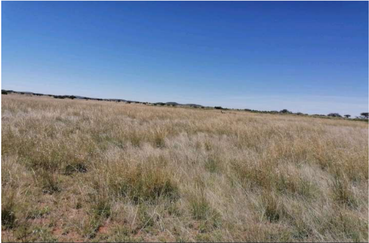
Figure 4: Another view of the site proposed for the development, note the grass that define the area.