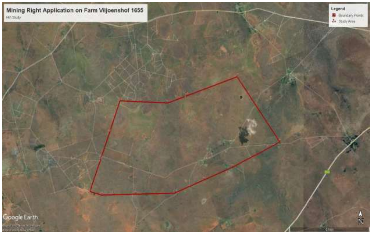
Figure 1: Google Earth view of the study area.